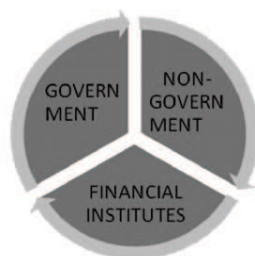
Fig: 1. The support extended by institutions for Women Entrepreneurs

Introduction : The emergence of women entrepreneurs and their contribution to the national economy is quite visible in India. The same can be seen in Patna also, where women are becoming self reliant and financially independent through self employment. Women entrepreneurs may be defined as a woman or a group of women who initiate, organize and operate a business enterprise. Government of India has defined women entrepreneurs as an enterprise owned and controlled by women having a minimum financial interest of 51% of the capital and giving atleast 51% of employment generated in the enterprise to women.