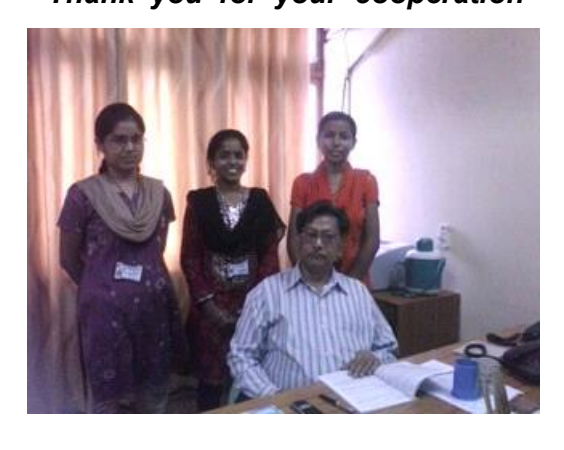
Thank you for your cooperation

Ans. We try to alert the people before coming flood and we are also finding new techniques for better results.