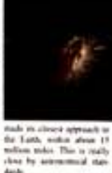
made its closest approach to the Earth, within about 15 million miles. This is really close by astronomical standards.

It is believed it is being discovered by a telescope in Hawaii, astronomers caught of two objects on Hawaiian island - a flat-topped shape and a long one - in previous a name. And they suggested "Oumuamua", which means 'messenger' or 'messenger from the distant past' reaching out to us.