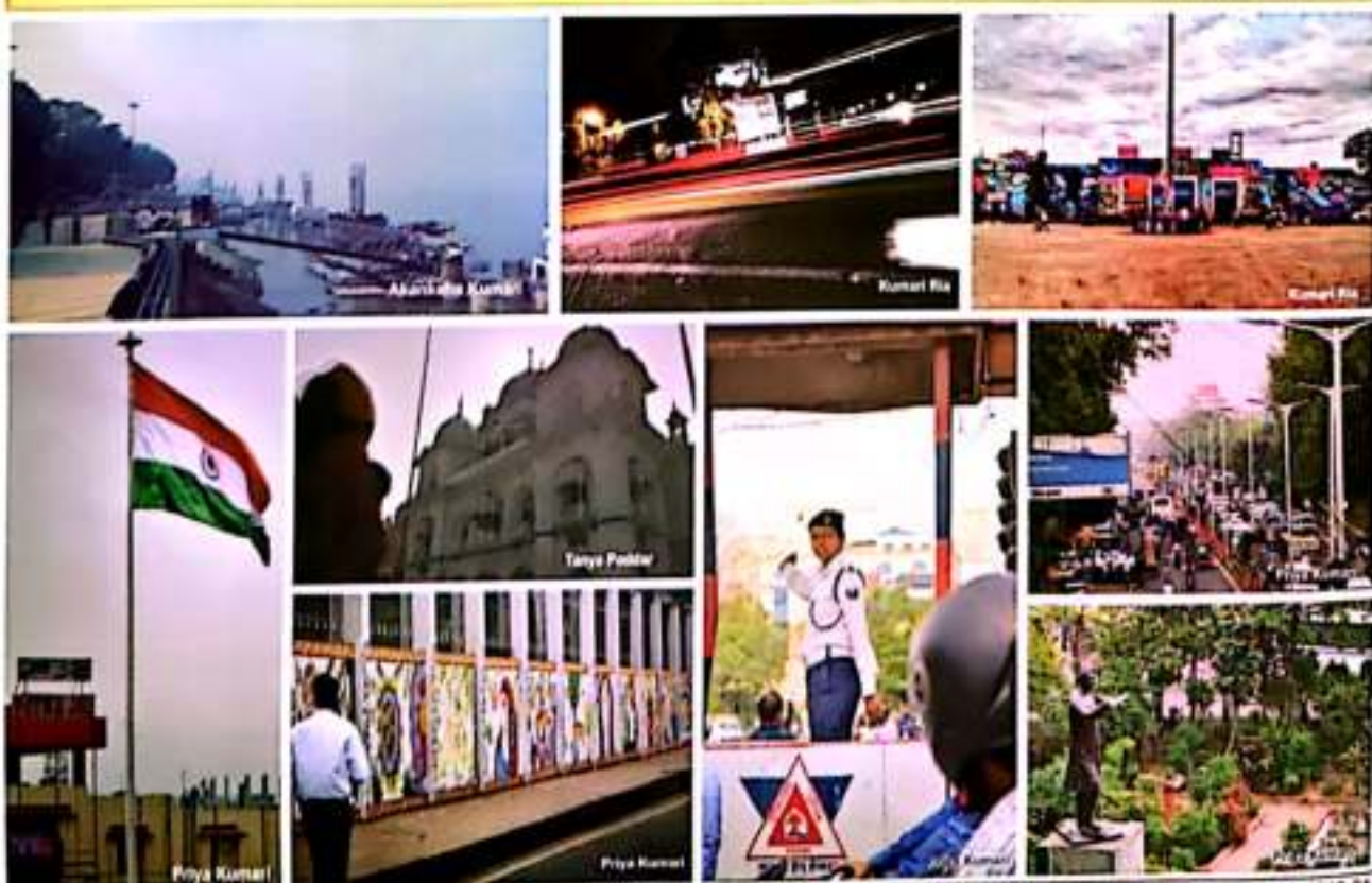
Compiled and Edited by BMC-2019-21