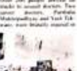
Doctors on strike in India.