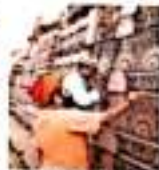
People gathered at the site of the disputed land in Ayodhya.