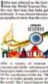
India as a host country for the world economy.

India was selected as the host country... The World Economic Forum... The World Economic Forum...