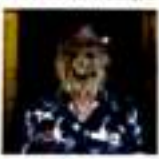
A boy with hypertrichosis disease.