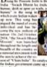
People participating in a Swachh Bharat activity.