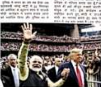
दोस्ताना अंतर में एक कार्यक्रम पर प्रधानमंत्री नरेंद्र मोदी और अमेरिकी राष्ट्रपति डोनाल्ड ट्रंप का संयुक्त स्वागत।

दुनिया ने अमेरिका के दस्तियों पर भारत के दम का जवाब दे दिया। अमेरिका के दस्तियों पर भारत के दम का जवाब दे दिया। अमेरिका के दस्तियों पर भारत के दम का जवाब दे दिया।